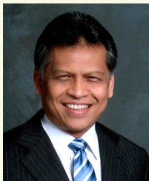
Dr. Surin Pitsuwan

Secretary-General of ASEAN (2008-2012), Minister of Foreign Affairs (1997-2001), Deputy Minister of Interior