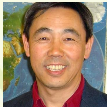
Dr. Jianguo Qi

Secretary-General of ASEAN (2008-2012), Minister of Foreign Affairs (1997-2001), Deputy Minister of Interior